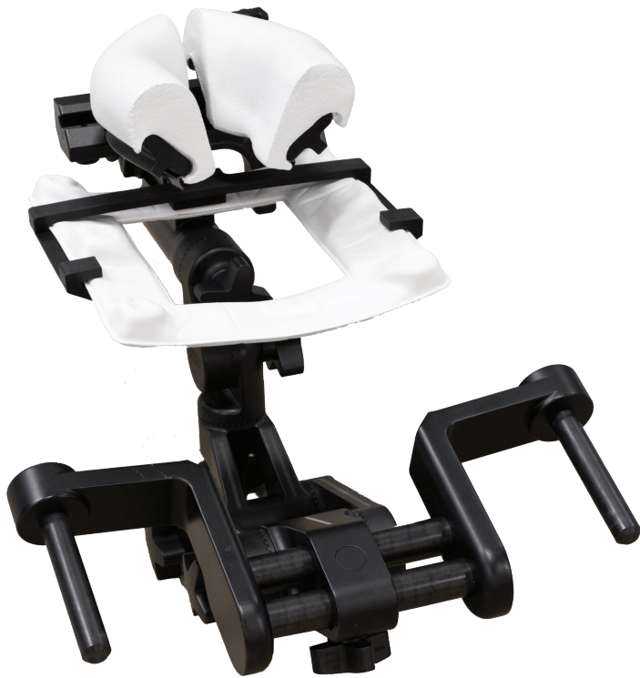
HORSESHOE HEADREST AND PAD ATTACHED TO HFD100 WITH WIRELESS IMAGING COIL INSERTED

The first non-pinned headrest that is both MR safe and CT compatible.