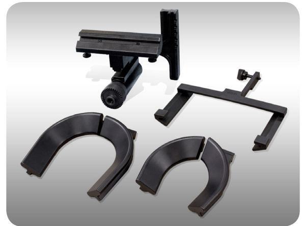
Horseshoe Headrest Reusable Components