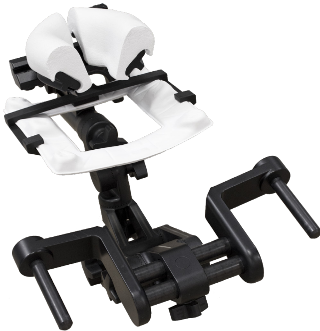
Horseshoe Headrest and pad attached to HFD100 with Wireless Imaging Coil inserted

The first non-pinned headrest that is both MR safe and CT compatible.