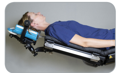
Table may be tilted during scanning

For more information, contact IMRIS at +1 763-203-6300, or visit our website for additional product information, www.imris.com .