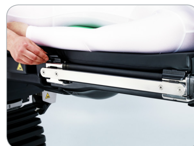
MR Neuro OR Tabletop