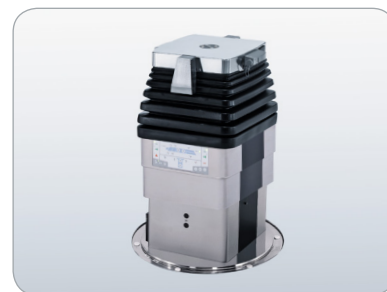
Hill-Rom TruSystem® 7500 column