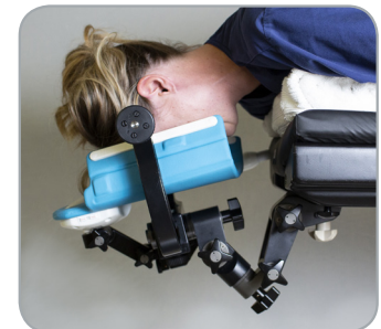
Patient's head below level of table